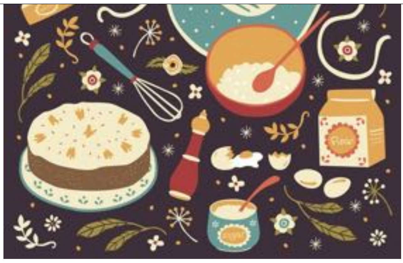
By: Abigail Scott Culminating Assignment OHEA Self-Study Course

A compilation of family-friendly recipes with tips on how to adapt to your family and how to get your kids into the kitchen, ensuring they enjoy the process and learn from it.